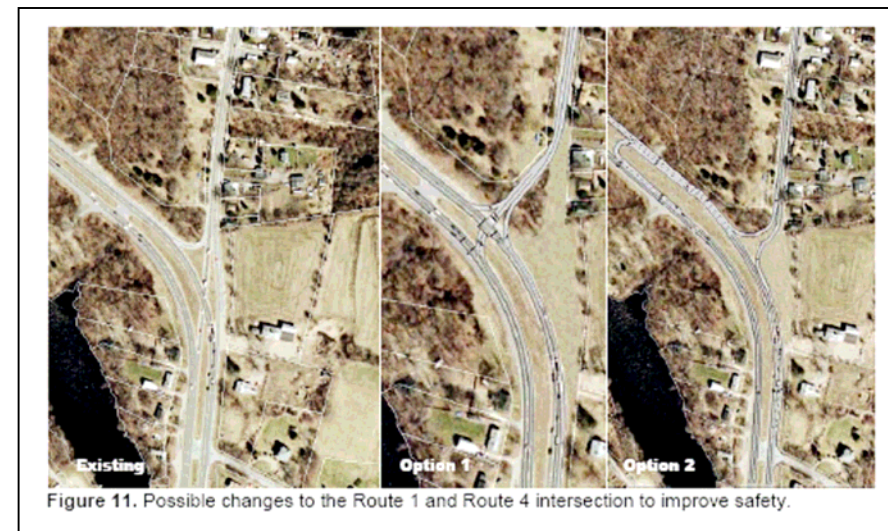
Figure 11. Possible changes to the Route 1 and Route 4 intersection to improve safety.